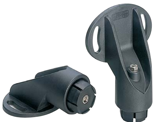
SIDE MOUNTING TOP BRACKET with expansion plug for round tubes Ø 48.3x1.5 mm

Components: external part in reinforced polyamide. Conical insert in reinforced polyamide. Threaded bushing in nickel plated brass. Bolt and washer in stainless steel.