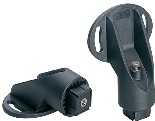
SIDE MOUNTING TOP BRACKET with expansion plug for square tubes 40x40x2 mm

Components: external part in reinforced polyamide. Conical insert in reinforced polyamide. Threaded bushing in nickel plated brass. Bolt and washer in stainless steel.